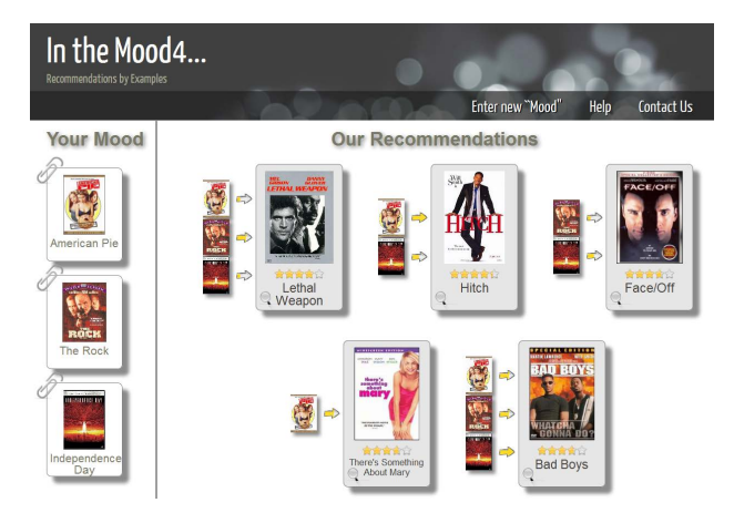
Figure 1: Mood4 's main screen

We briefly overview below the algorithm used by Mood4; we start with a brief description of CF and some notation. We then describe the geometric representation being used and explain how