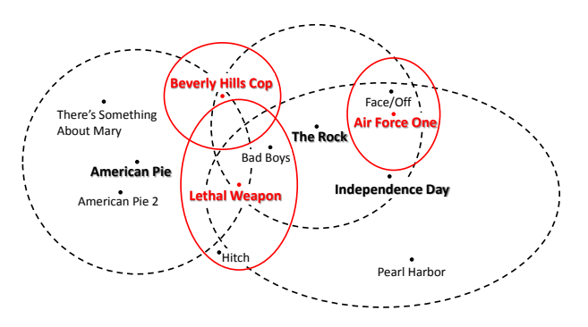
(b) Geometric Representation with Joint Representatives (partial)

Weighting. We now augment the seeds set by the selected joint representatives<sup>1</sup> and rebuild the geometric representation for the extended seeds set. To take the items rating into consideration, we combine (multiply) as above the similarity and the rating of the items, then normalize the results not only by the mean rating, but also by the mean similarity of the neighborhood of the corresponding seed item. This refined similarity measure between an item i