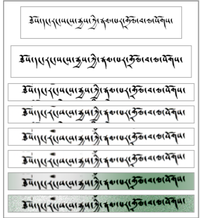
Fig. 1. Illustration of the text augmentation procedure. The first two images are renderings of text using different font sizes, stretch, weight and spacing; the 3rd is the text after rendering it together with adjacent lines and performing line segmentation; 4th is the result of performing elastic deformation augmentation on the image; 5th is after sinusoidal displacement; 6th is after rotation; 7th is after intensity gradient noise; 8th is after adding white Gaussian noise.

Multiline image rendering: As consecutive lines in the texts contain overlapping characters, we find that it is critical for the training data to contain such structure as well. Thus, when creating the synthetic data we do not render each line separately, but rather a number of text lines consecutively in each image. On the multiline images we run the same line segmentation algorithm that we run on the original data. As shown in Section V, this process